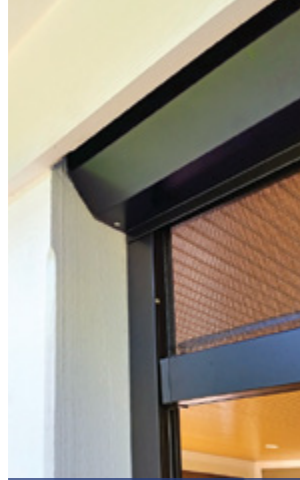
Headbox neatly contains the screen when closed