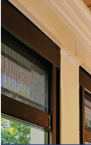
Zip fabric retention side channels keep insects outside where they belong