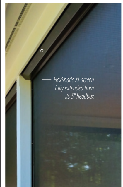
FlexShade XL screen fully extended from its 5" headbox